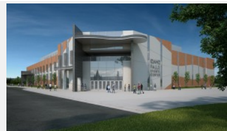
The Idaho Falls Events Center will have 4,000 fixed seats and up to 6,500 seats for concert seating.

stretch of a nine-year quest to build a multipurpose event center.