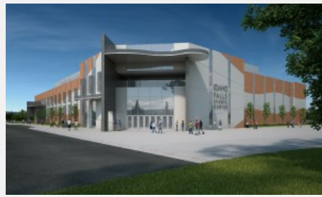
The Idaho Falls Events Center will have 4,000 fixed seats and up to 6,500 seats for concert seating.

The Idaho Falls Auditorium District is in the home stretch of a nine-year quest to build a multi-purpose event center.